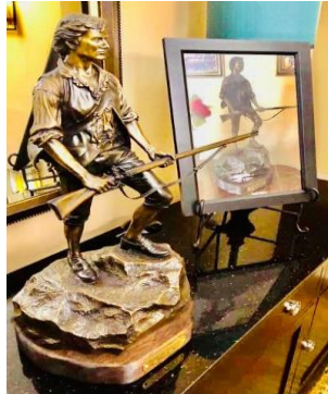
Sons of Liberty Statue

Valued in excess of $6,000 , the drawing tickets are just $25 each or 5 for $100 . Mail a check to FLSSAR Statue c/o Palm Beach Chapter, PO Box 16735 West Palm Beach FL 33416.